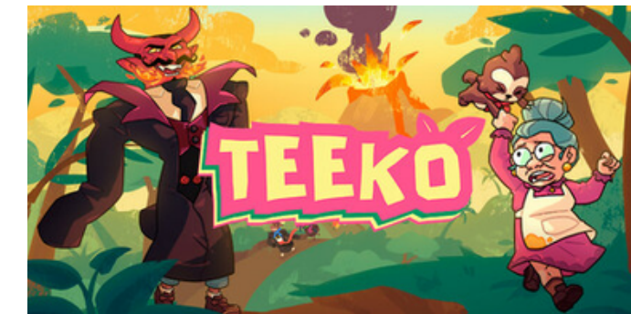
TEEKO PC / Mobile Game ANNOUNCED