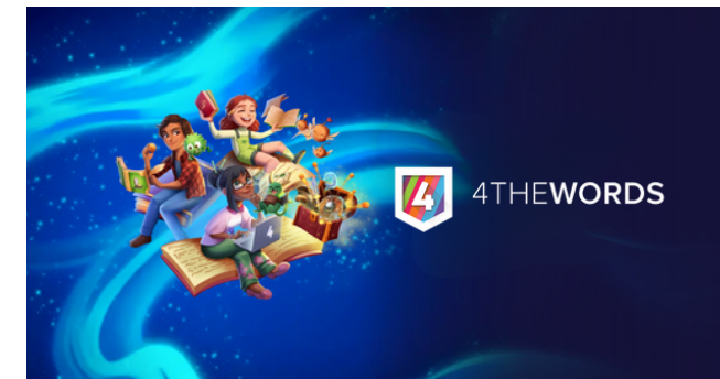
4THEWORDS PC / Mobile Game PUBLISHED