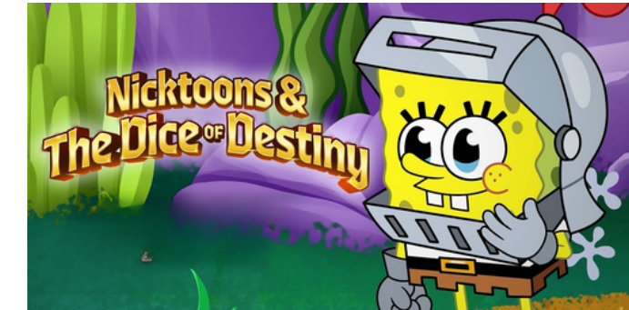
Nicktoons & The Dice of Destiny PC & Console game PUBLISHED

Companies our team members have collaborated with: