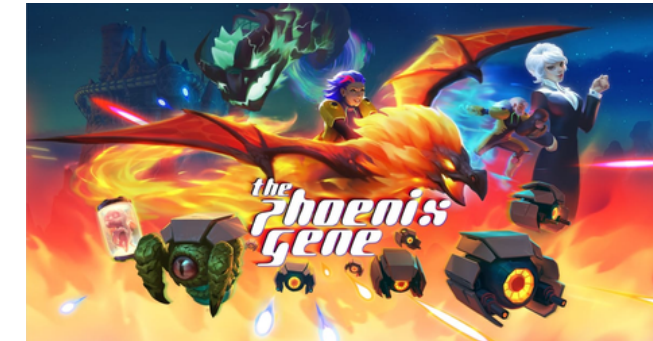
THE PHOENIX GENE VR Game PUBLISHED