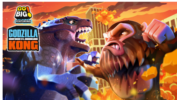
GODZILLA VS KONG Mobile Game PUBLISHED

Projects our team members have worked on: