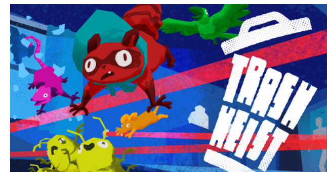
TRASH HEIST PC / Mobile Game ANNOUNCED