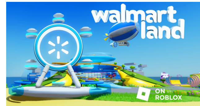
WALMART LAND Multiplatform Experience PUBLISHED